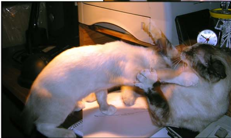
Verne was happy to see that Dust Ball had a play mate. She was learning all the kitten game such as "Hide and seek", "Ambush", "Chase me--chase you", "Kitten wrestling", "Kitten boxing", and "Can you do this?"